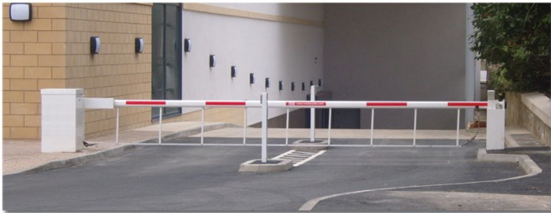
The Compact Terra Barrier is a drop arm automatic barrier which has been successfully impact tested in accordance with BSi PAS 68

The standard aluminium boom is fitted with a high tensile cable and the barrier requires a shallow foundation depth of only 500mm. Boom lengths are available up to 6000mm