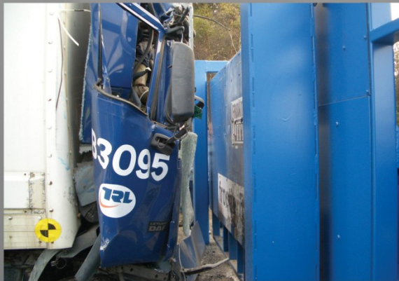
Terra Gate impact test result in fully closed position

On both impacts the Terra Gate brought the vehicle to a complete halt with zero penetration onto site or past the impacted face of the unit. The Terra Gate is the only gate in the World to be impacted in both the fully closed and the half open positions without the need for repair.