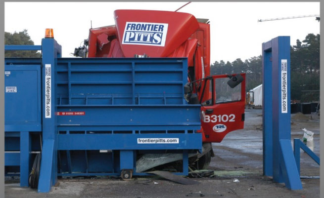
Terra Gate impact test result in half open fully position