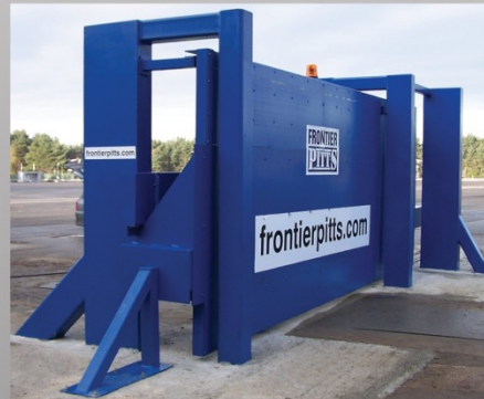
Terra Beam based on the successfully impact tested Terra Sliding Gate

On both impacts the Terra Gate brought the vehicle to a complete halt with zero penetration onto site or past the impacted face of the unit. The Terra Gate is the only gate in the World to be impacted in both the fully closed and the half open positions without the need for repair.